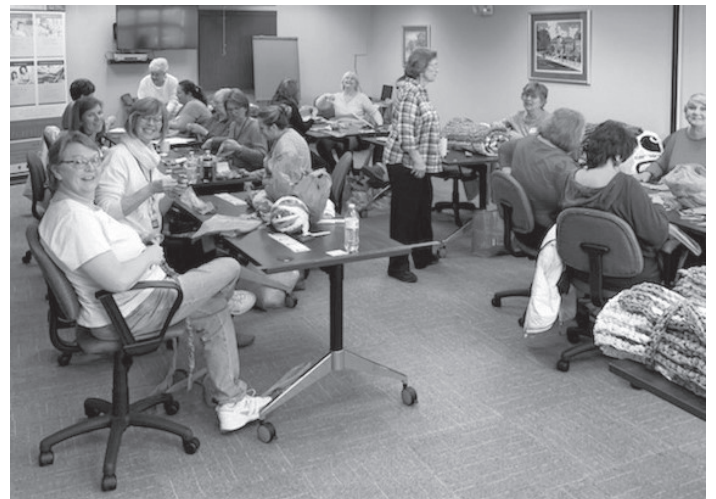
Mercy Mat volunteers